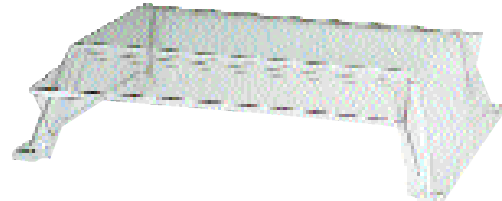
Model 45SG-FCA with optional SGS Sneeze Guard Shields