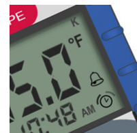
Count-down timer and alarms