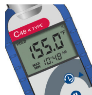
Max/Min feature recalls highest and lowest reading