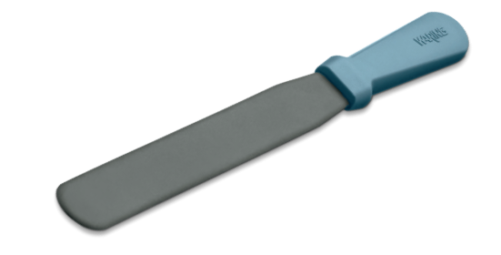
CAC173 Silicone Crêpe Spatula