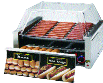
Model 50CBD with Sneeze Guard