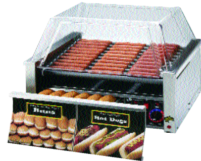
Model 50CBD with Sneeze Guard