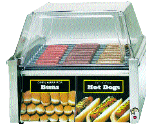
Model 30SCBD with Sneeze Guard