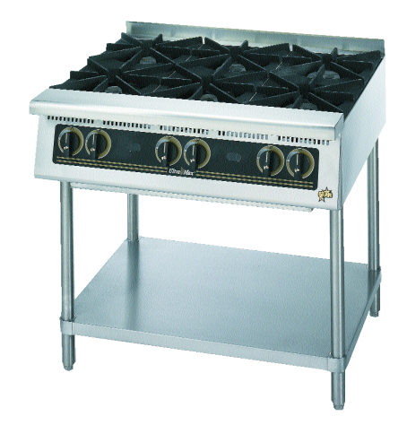
Model 806H Shown with Optional Floor Stand