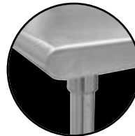
NEW Rolled Rim Edges on Front & Back and Square Side Edges