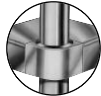
Featuring as Standard: "THE PROVEN" ORIGINAL ADVANCE TABCO Adjustable Undershelf with Die Cast Leg Clamp