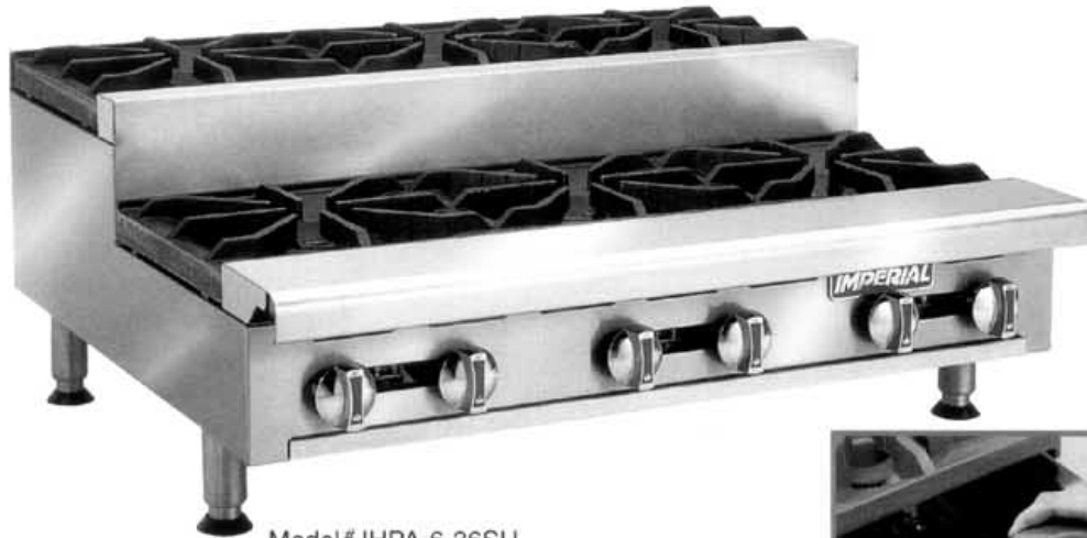
Model # IHPA-6-36SU