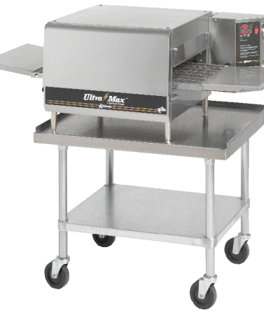
UM-1833A with Optional Stand

Star Manufacturing International, Inc. - 10 Sunnen Drive - P.O. Box 430129 - St. Louis, MO 63143-3800 Phone: (800) 264-7827 - FAX: (800) 264-6666 - www.star-mfg.com H: