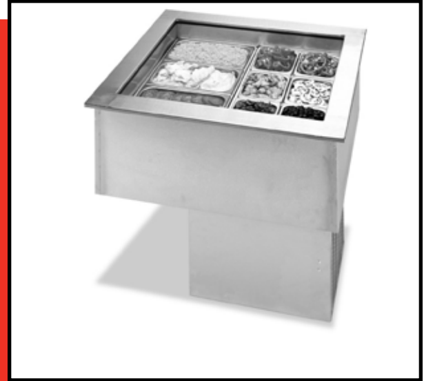
DROP-IN COLD WELL