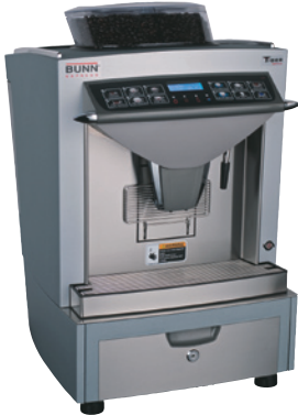
Model Tiger XL Cool Froth with milk drawer

Dimensions: 25.5"H x 15.8"W x 18.1"D (64.8 cm H x 40.1 cm W x 45.9 cm D)