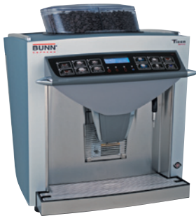
Model Tiger XL Cool Froth EXT external milk

Dimensions: 25.5"H x 15.8"W x 18.1"D (64.8 cm H x 40.1 cm W x 45.9 cm D)