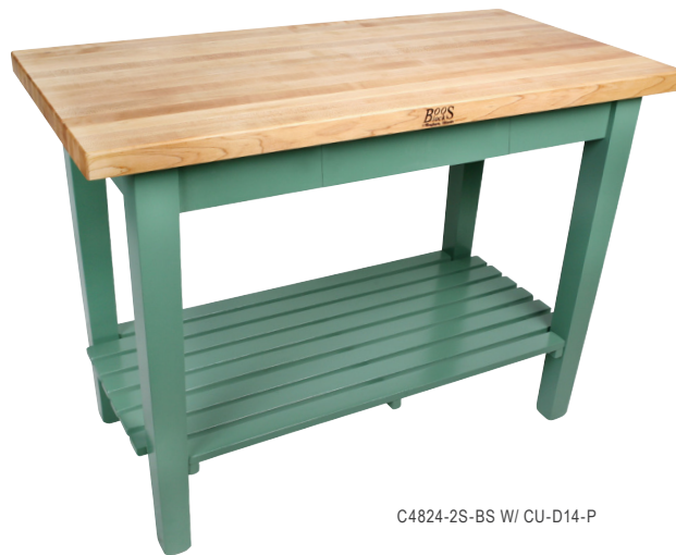
C4824-2S-BS W/ CU-D14-P