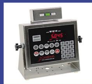
Optional checkweigher light bar for model 210.