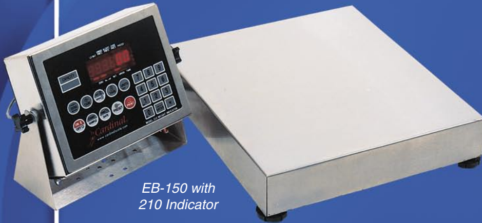
EB-150 with 210 Indicator

Designed for top performance and long-term accuracy.