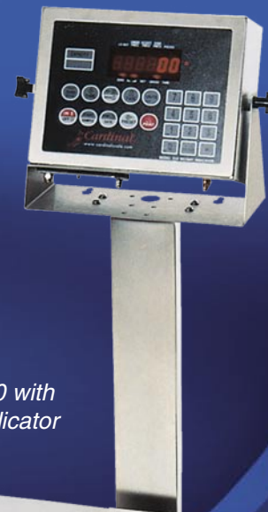
EB-300 with 210 Indicator