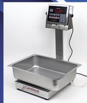
Optional commodity pan with built-in drain.

Whatever your needs may be, select from Cardinal's complete line of stainless steel bench scales.