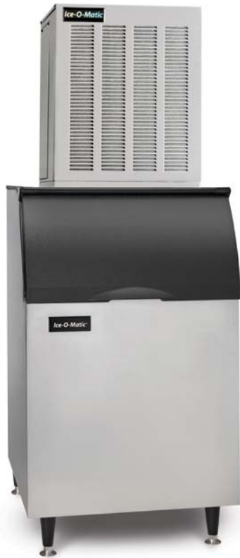
MFIO800 ON B55