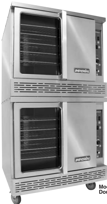
Model ICVD-2 Gas Double Deck, Bakery Depth