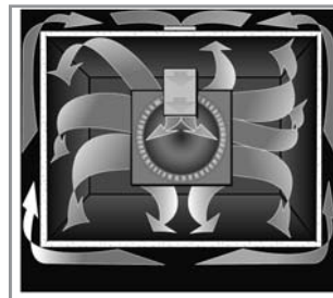
Turbo-Flow provides even heat throughout the oven