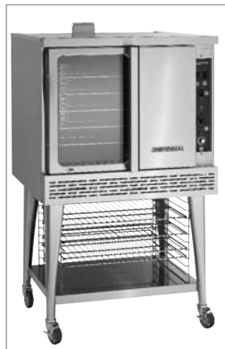
Model ICVG-1 Shown with optional s/s shelf and adjustable rack supports