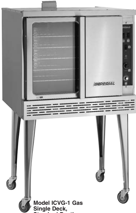
Model ICVG-1 Gas Single Deck, Standard Depth