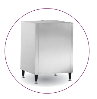
DMS21 STAND 26″ x 21″ x 36.″ Stainless steel.