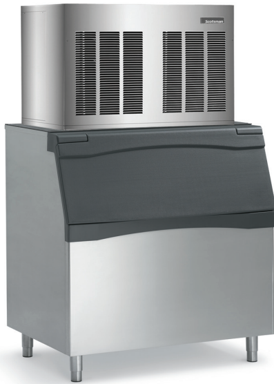
Shown on B948S bin with optional KLP8S legs..

Modular Flake Ice Machine with AutoSentry™