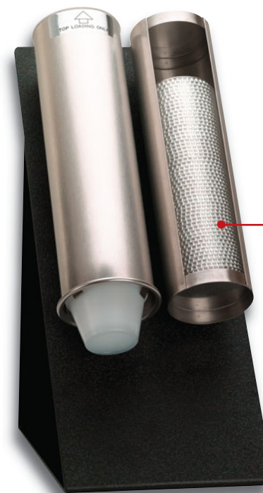
SFL-STAND-2 shown here with SFL-ADJ and SFL-TLD portion cup & lid dispensers