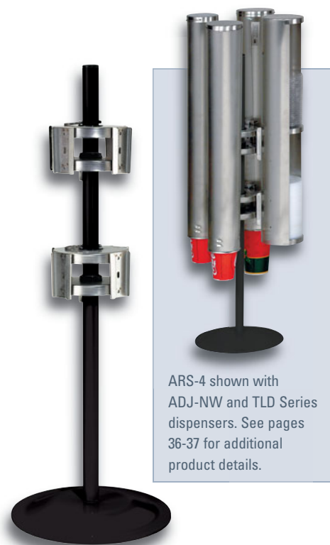
ARS-4 shown with ADJ-NW and TLD Series dispensers. See pages 36-37 for additional product details.