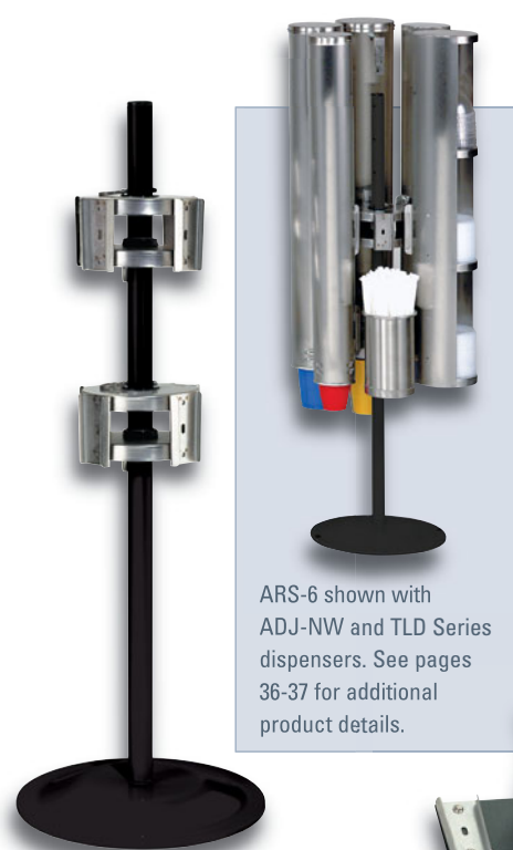
ARS-6 shown with ADJ-NW and TLD Series dispensers. See pages 36-37 for additional product details.