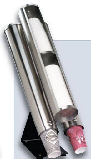
EZ-3EZ shown with ADJ-NW and TLD Series dispensers. See pages 36-37 for additional product details.