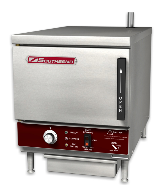
(EZ18-3 shown with optional drain pan)