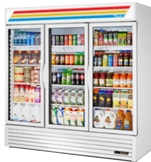
Optional White Exterior