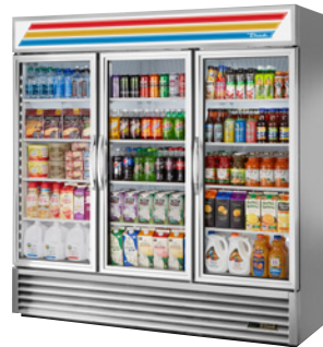
Optional Stainless Exterior