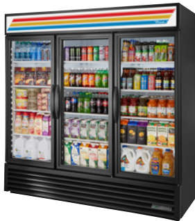
Standard Black Exterior