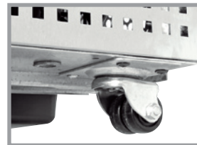
1 1/2" diameter dual swivel castors for "LP" models.