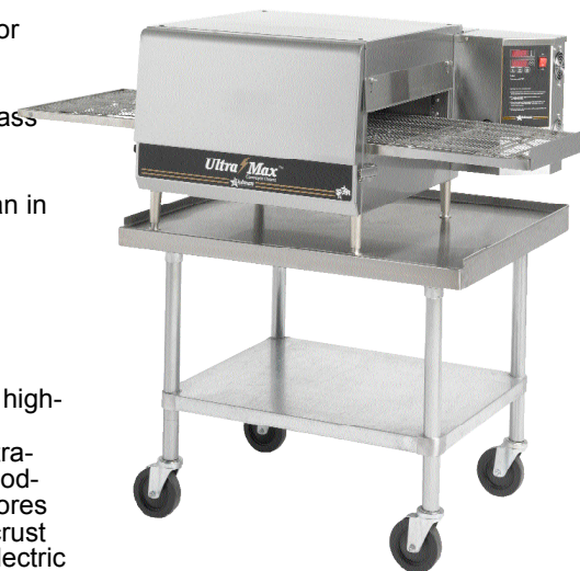
UM-1850A with Optional Stand