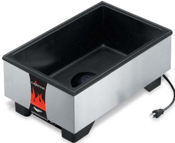
Cayenne® Model 1001 Warmer