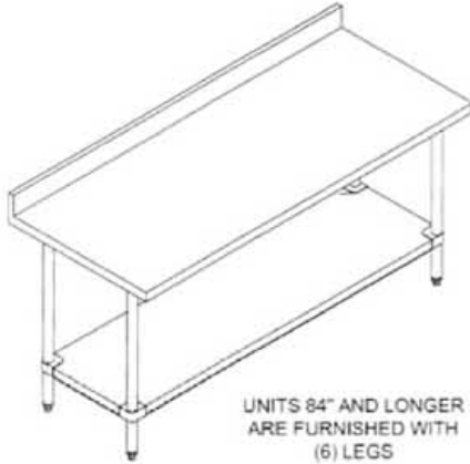
UNITS 84" AND LONGER ARE FURNISHED WITH (6) LEGS